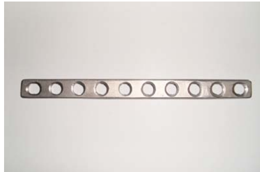
Fig. 1: Titanium plate implant for long bones

Considering the increasing use of Titanium and its alloys for medical purposes, numerous studies to increase biocompatibility by scaling different implants with Titanium oxide have been performed. There are many methods of achieving TiO 2 scaling, but the most accessible one and the one studied in this paper is thermal oxidation. In order to obtain the TiO 2 thin coat, several samples obtained from Titanium plate implants ( Fig. 1 ) were oxidized at different temperatures and maintained for different periods of time in an oven. [2]